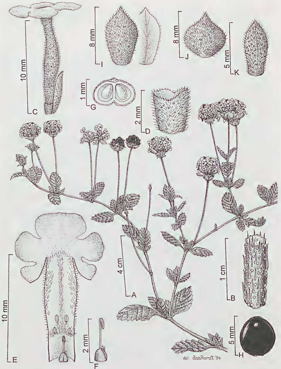
Fig. 2. Lantana montevidensis (Spreng.) Briq. (A–K, A.R. Bean 6734: BRI). A, habit drawing of a branch with flowers and fruit; B, portion of stem showing hairs and glands; C, flower with bract; D, calyx with 4 shallow teeth; E, longitudinally cut open corolla showing androecium and gynoecium; F, gynoecium with oblique stigma; G, transverse section of ovary; H, fruit; I, middle bract showing abaxial and adaxial view; J, out bract showing abaxial view; K, inner bract showing abaxial view.